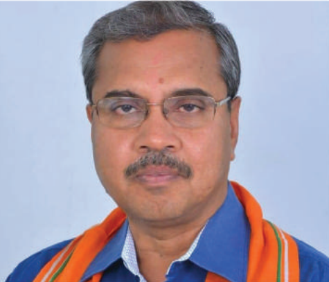
SHRI DR. MUNJAPARA MAHENDRABHAI (Hon'ble Minister of State for Woman & Child Development - Govt. of India)