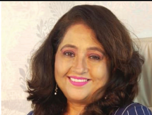
SWETTA JUMAANI (Celebrity Astro - Numerologist)