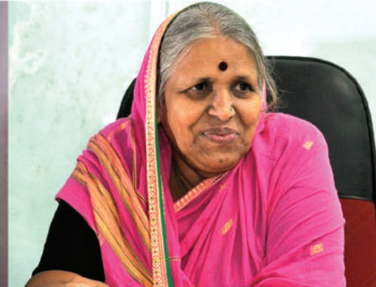
DR. SINDHUTAI SAPKAL (Mother of Orphans) Social Activist